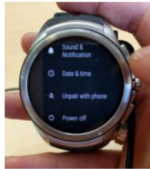
Figure 5. Disconnect & reset.