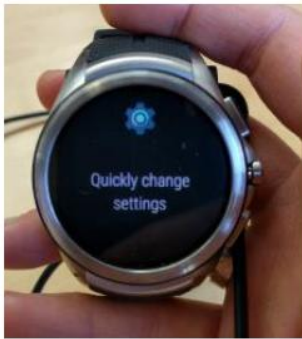
Figure 4. Quickly change settings